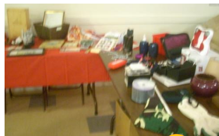
Some of the goodies