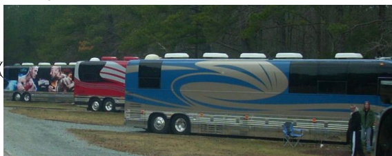
WWF parked right beside us!